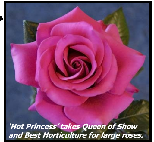
'Hot Princess' takes Queen of Show and Best Horticulture for large roses.