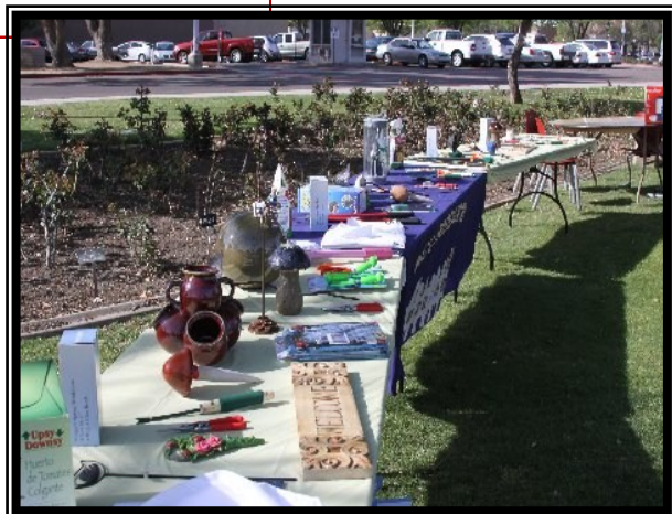
Items on the raffle table for the "End of Pruning Party" in the MCC Rose Garden