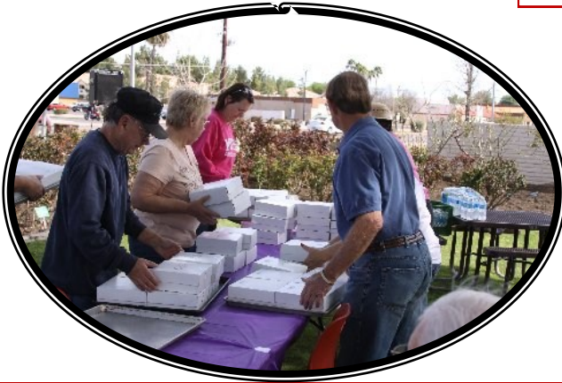
Fabulous box lunches were served at the Garden Party.