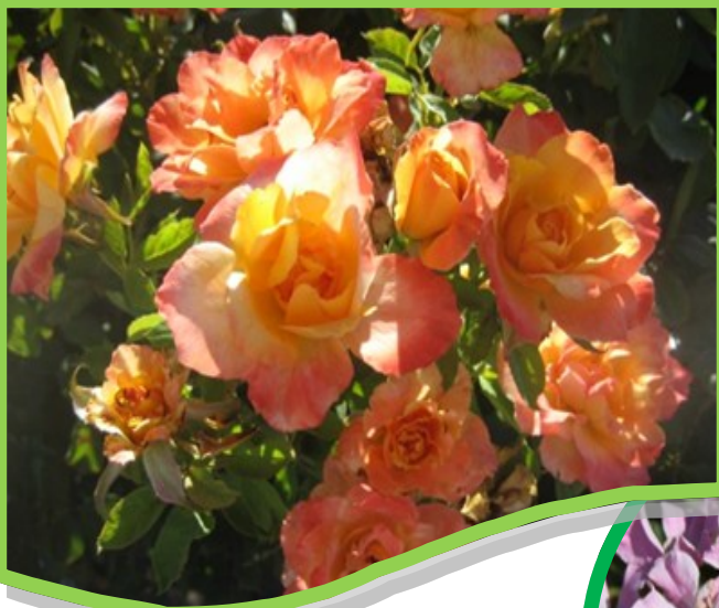
Strike it Rich – A grandiflora

If you are looking for roses that handle the heat better than others, this is the time to visit the Rose Garden at MCC. There you can look at over 8000 roses and see what varieties take the heat better than others. This past month in July, with camera in hand, I walked throughout the garden and was amazed how much color was in the garden. I snapped a few pictures of roses that I thought were doing exceptionally well.