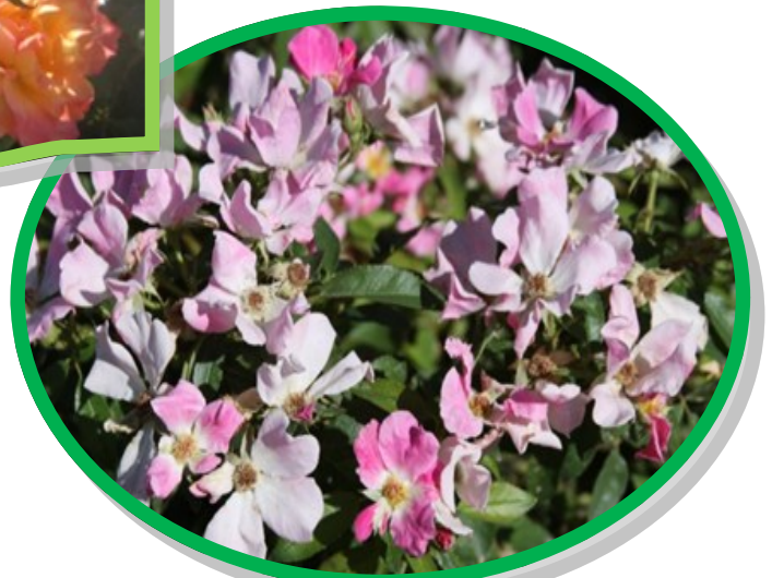
Watercolor – A shrub rose |