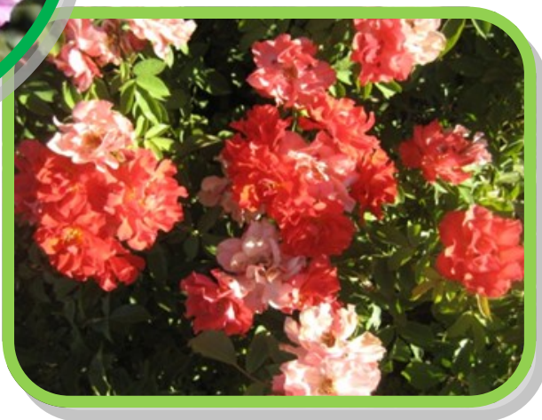
Strike it Rich – A grandiflora rose