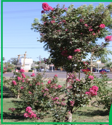
Summer Color in the MCC Rose Garden Crape Myrtle in bloom