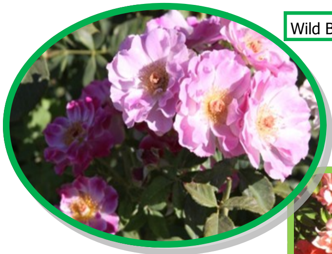
Wild Blue Yonder –A grandiflora rose