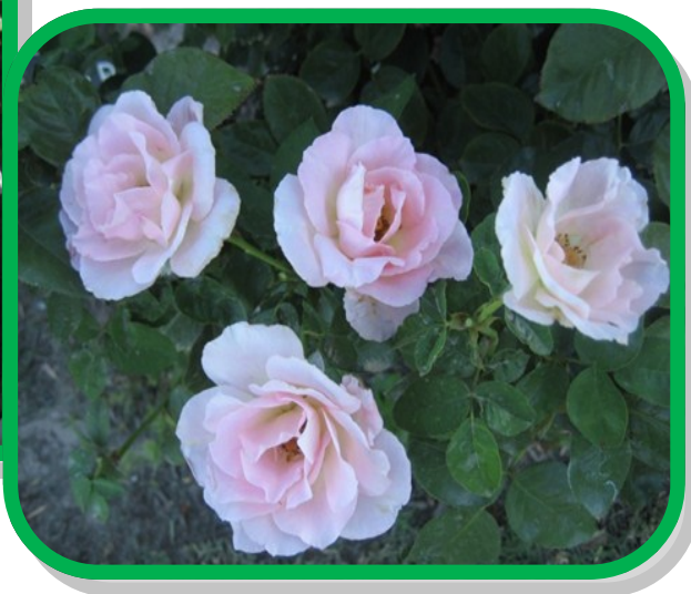
Memorial Day –Hybrid Tea