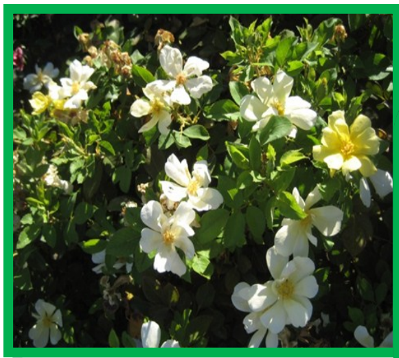
Sunny Knock Rose