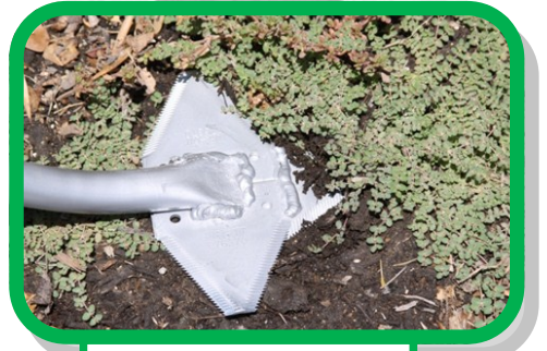
Weeder in action

Several MEVRS members and members of the MCC Deadheaders have purchased these weeders and great comments come from all who have used it. If you are interested in buying a weeder, give Bill a call at 480-748-1022 or email him at phylbill22@aol.com . The long handle weeder sells for $20.00 and the short handle weeder is $15.00.