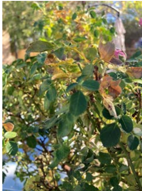
Rose #4 closeups