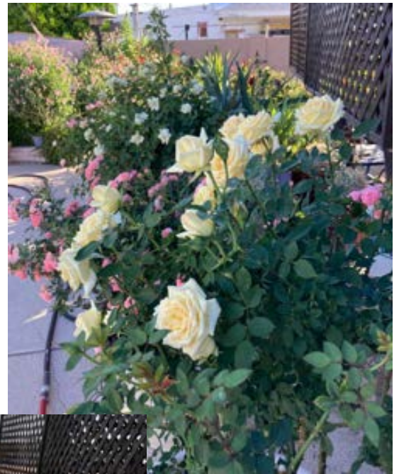
More of Bud and Yvonne's garden